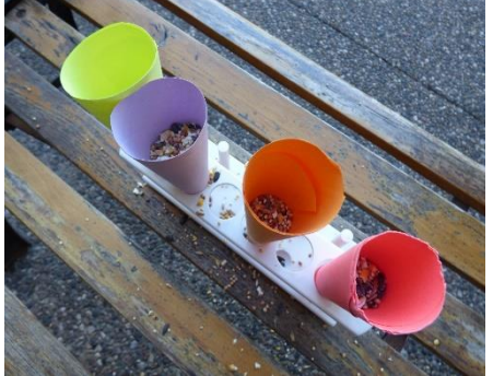
Food for the Brood gives students a bird's perspective as they race back and forth to fill hungry beaks.