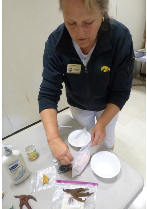
Making animal tracks if fun and tactile! This exercise helps students learn how to identify common animal tracks and how looking for evidence of wildlife can help determine what animals live in a certain area.